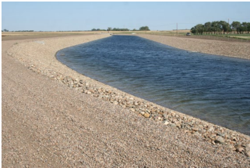
What to expect: Photo of the recently renovated Eastside Canal, east of the Westside Project.