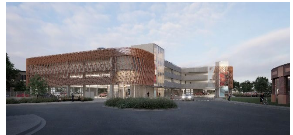
Renderings of the new Regina General Hospital parkade.

The new parkade at the Regina General Hospital will improve safety and accessibility for hospital staff, patients and visitors. It will be built in the northwest portion of the existing visitor parking lot and provide a total of 1,005 stalls, consisting of 873 stalls in the parkade and 132 surface stalls, for a net increase of 686 parking stalls.