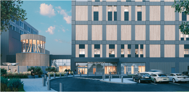
Rendering of the Prince Albert Victoria Hospital.

The agreement with PCL includes the design and construction of a new acute care tower connected directly north of the existing facility. The new tower features a heliport on the roof, an expanded emergency department, larger operating rooms, pediatrics, maternity, a Neonatal Intensive Care Unit, new medical imaging and a First Nations and Métis Cultural space, among other key services. The agreement includes an option to retain services for phased future renovations to the existing facility.