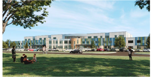
A rendering of the new Moose Jaw joint-use school.

Both sides of the facility will include adaptable learning environments, separate gymnasiums and a shared community resource space.