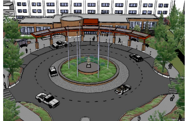
An early rendering of the new entrance at St. Paul's Hospital.

Upon completion, this project will improve safety, accessibility, patient flow and establish a First Nations and Métis Cultural Healing Centre equivalent to those at Regina General and Pasqua Hospitals. The new Healing Centre will offer space for celebration of culture and for patients to seek culturally safe healing.