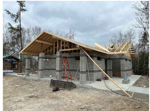
A new service centre under construction at Makwa Lake Provincial Park.

With these investments, a total of over $203M will have been invested in capital investments and preventative maintenance in provincial parks since 2007.