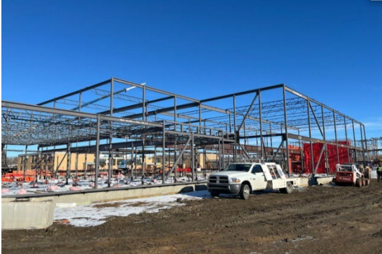
Construction progress on the new north Regina joint-use school.

This facility will provide space for approximately 800 pre-kindergarten to Grade 8 students, 400 Public and 400 Catholic, with the ability to expand to accommodate up to 1,000 students. The facility will also include community space and a 51-space childcare centre, which includes 21 new spaces.