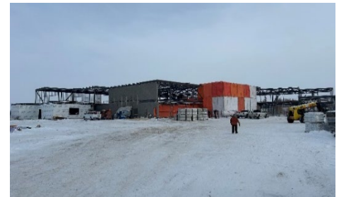
Construction progress on the new Lanigan K-12 school.