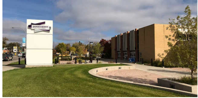
The Saskatchewan Polytechnic main campus in Saskatoon.

Saskatchewan Polytechnic currently delivers post-secondary education programs in 11 locations throughout Saskatoon. SBP and project partners are planning a new centralized campus to provide programming, training and administration services at Innovation Place Saskatoon.