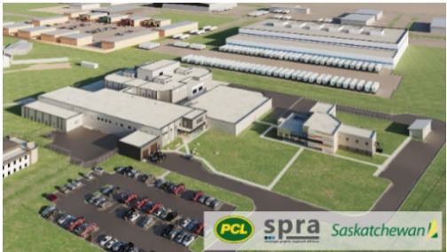
Rendered images of the Remand Centre expansion.