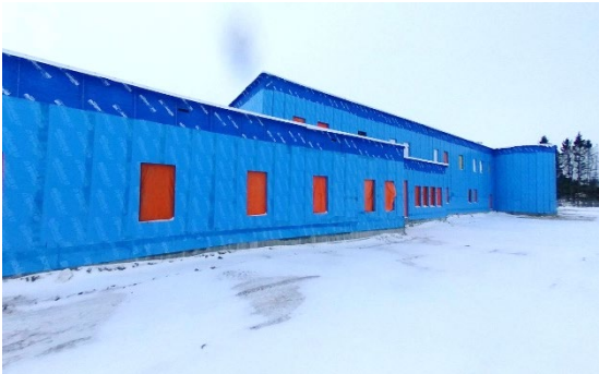
Construction progress on the new Ducharme Elementary School.

Ducharme Elementary School will feature local Indigenous cultural elements. The design was created with input from the community and features a rounded cultural centre that will be used for cultural programming and ceremonies, which incorporates architectural elements that reflect Indigenous culture. The school will have 26 classrooms, a kitchen for student meal programs, as well as a feature staircase that can be used for school gatherings.