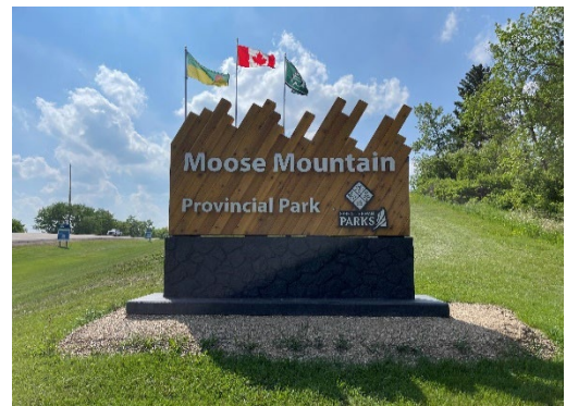
A new sign for Moose Mountain Provincial Park.