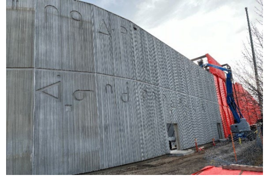
Construction progress on the new St. Frances school.