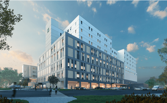
Rendering of the Prince Albert Victoria Hospital.

In February 2024, the design-build agreement was awarded to PCL Construction Management Inc. (PCL). The value of the construction contract is $898M and is inclusive of the Design and Early Works agreement awarded through a public procurement to PCL in December 2022.