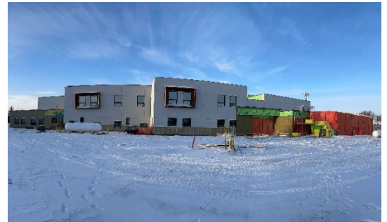
Construction progress on the new CÉF Regina school.

The Government of Saskatchewan is investing approximately $23.5M into CÉF Regina. The new school is part of a Memorandum of Understanding between the Ministry of Education and the Conseil scolaire fransaskois which includes a commitment to build three new francophone schools in the province. Regina is the first school to officially break ground with Saskatoon and Prince Albert schools currently in the pre-design phases.