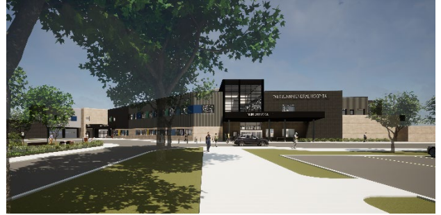
Rendering of the new Weyburn General Hospital.

The existing Weyburn General Hospital will be replaced with an integrated facility that includes 25 acute care and 10 in-patient mental health beds. The new hospital will be owned and operated by the SHA. It will also include an Emergency Medical Services garage and an adjacent heliport to support safer and more efficient patient transport.