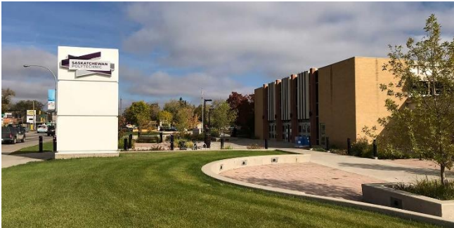
One of the Saskatchewan Polytechnic campuses located in Saskatoon.

Saskatchewan Polytechnic currently delivers post-secondary education programs in 11 locations throughout Saskatoon. SBP is exploring consolidating a campus that will provide programming, training, and administration services within a centralized location.