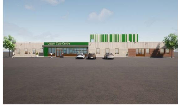
Rendering of the Regina Urgent Care Centre