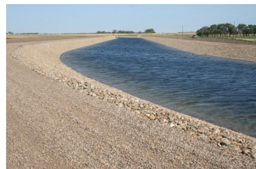
What to expect: Photo of the recently renovated Eastside Canal, east of the Westside Project