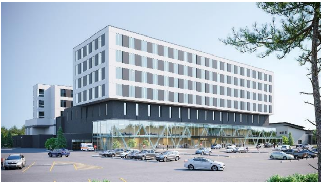
Architectural concept rendering of the Prince Albert Victoria Hospital

This project will construct a new multi-level acute care tower, replace the adult mental health space, and renovate the existing hospital building. Once complete, the number of beds at Victoria Hospital will be 242 on opening day, up from the current 173 beds, with space to expand further as needed. Other upgrades will include a larger emergency department and enhanced medical imaging services, including an MRI.