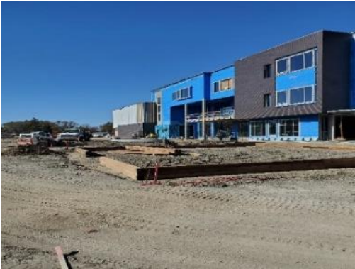
Construction progress on the Regina Argyle / St. Pius joint-use elementary school.

Once finished, the building will be able to accommodate 800 students - 400 on each side. Both schools will be built to expand capacity to 500 students through the addition of relocatable classrooms. This state-of-the-art facility will be 11,050 square meters, including a child-care centre that will have space for 51 children. The facility will also have outdoor learning areas and a mini gym that can double as a space for school and community events.