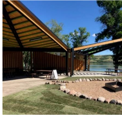
An example of a day-use pavilion.

The Government of Saskatchewan is committed to providing facilities that are safe, accessible, and well-maintained so visitors can enjoy time spent in provincial parks with family and friends.