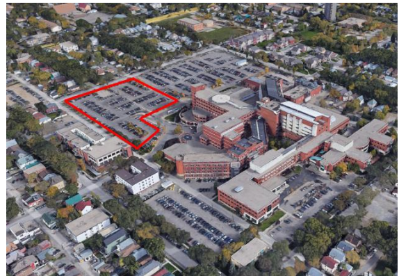
The new parkade will be located on the northwest corner of the Regina General Hospital lot.

The new parkade at the Regina General Hospital will improve safety and accessibility for hospital staff, patients and visitors. It will be built in the northwest portion of the existing visitor parking lot and will provide a minimum of 800 stalls, a net increase of at least 566 parking stalls. Once completed, the parkade will offer a much-needed upgrade to parking services for the hospital. The SHA will lease the 800 stalls from the chosen proponent.