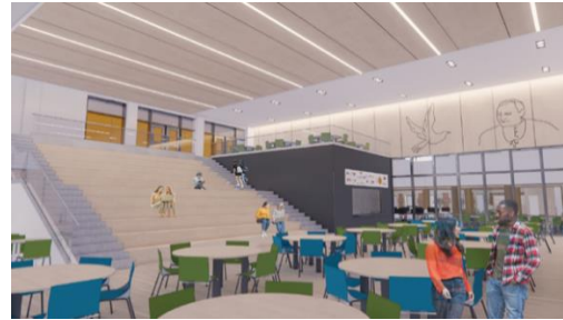
Renderings of the John Paul II Collegiate project.