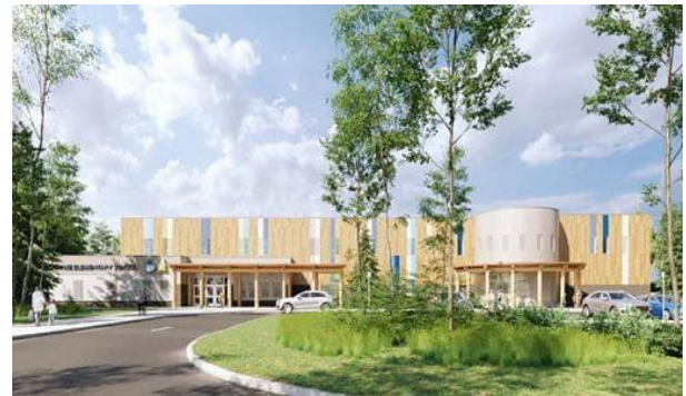
Rendering of the new Ducharme Elementary School.

Ducharme Elementary School will be a state-of-the-art facility and feature local Indigenous cultural elements. The design was created with input from the community and features a rounded cultural centre that will be used for cultural programming and ceremonies, which incorporates architectural elements that reflect Indigenous culture and the natural beauty of the local land and sky. The school will have 26 classrooms, a kitchen for student meal programs as well as a feature staircase that can be used for school gatherings.