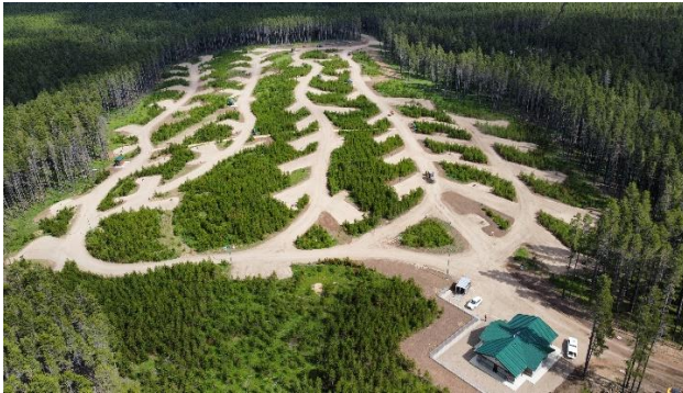
An aerial view of the Pine Hill Campground development, which opened in summer 2022.

Park facility and infrastructure improvements that SBP delivers in collaboration with PCS include: