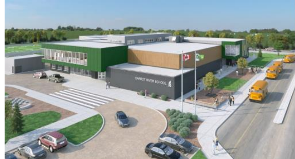
Renderings of the new Carrot River K-12 school.