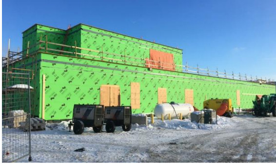
Construction of the Regina Urgent Care Centre

Located at the corner of Albert Street and 7th Avenue, the 24-hour Urgent Care Centre in Regina will offer residents an alternative to emergency departments for illnesses and injuries that are not life threatening but require urgent treatment. Services will include timely injury and illness care, basic diagnostic services and mental health and addictions supports.