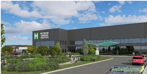
Rendering of the new Weyburn General Hospital

The existing Weyburn General Hospital will be replaced with an integrated facility that includes 25 acute care and 10 in-patient mental health beds. The new Weyburn General Hospital will be owned and operated by the SHA. It will also include an EMS garage and an adjacent heliport to support safer and more efficient patient transport.