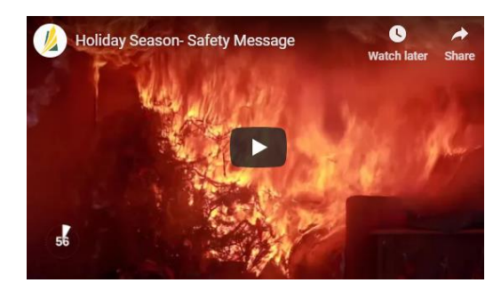
Go to https://youtu.be/_YvHr_tUMxw to watch this video demonstrating how quickly your Christmas tree can catch on fire.

Give the gift of safety this season by following the tips below as part of your 12 Days of Holiday Safety.