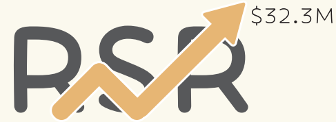
INCREASE TO THE RATE STABILIZATION RESERVE