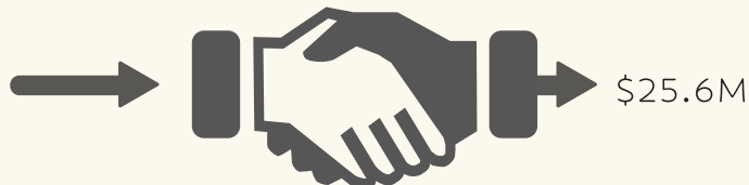
DIVIDEND PAID TO GOVERNMENT OF SASKATCHEWAN