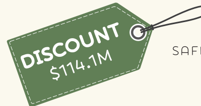
SAFE DRIVER DISCOUNTS