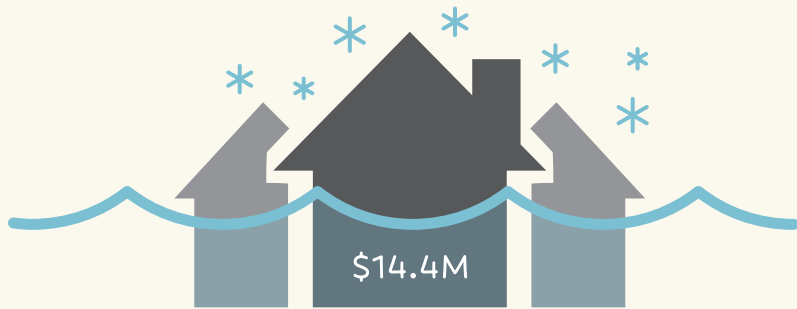
UNDERWRITING LOSS DUE TO WEATHER-RELATED CLAIMS