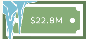
ICE DAM CLAIMS IN SASKATCHEWAN