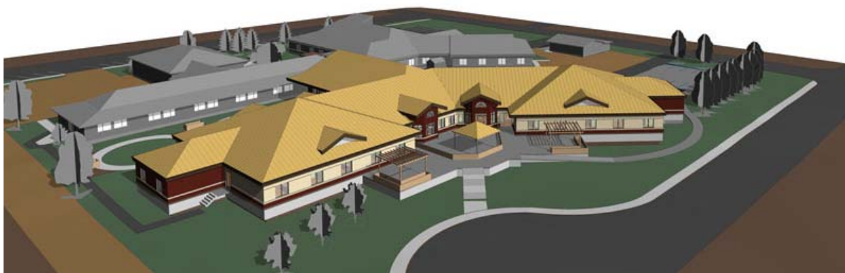
The addition (foreground) will be built adjacent to the existing Redvers Health Centre..

When construction is complete, all services from the Centennial Haven wing will move to the two new, more home-like units.