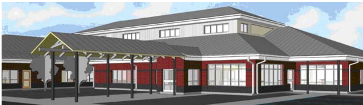
Construction of the new Radville integrated health facility will be finished in 2013.

When construction is complete, all services from the Radville Marian Health Centre will move to the new building. Residents from the long-term care area will live in two home-like units.